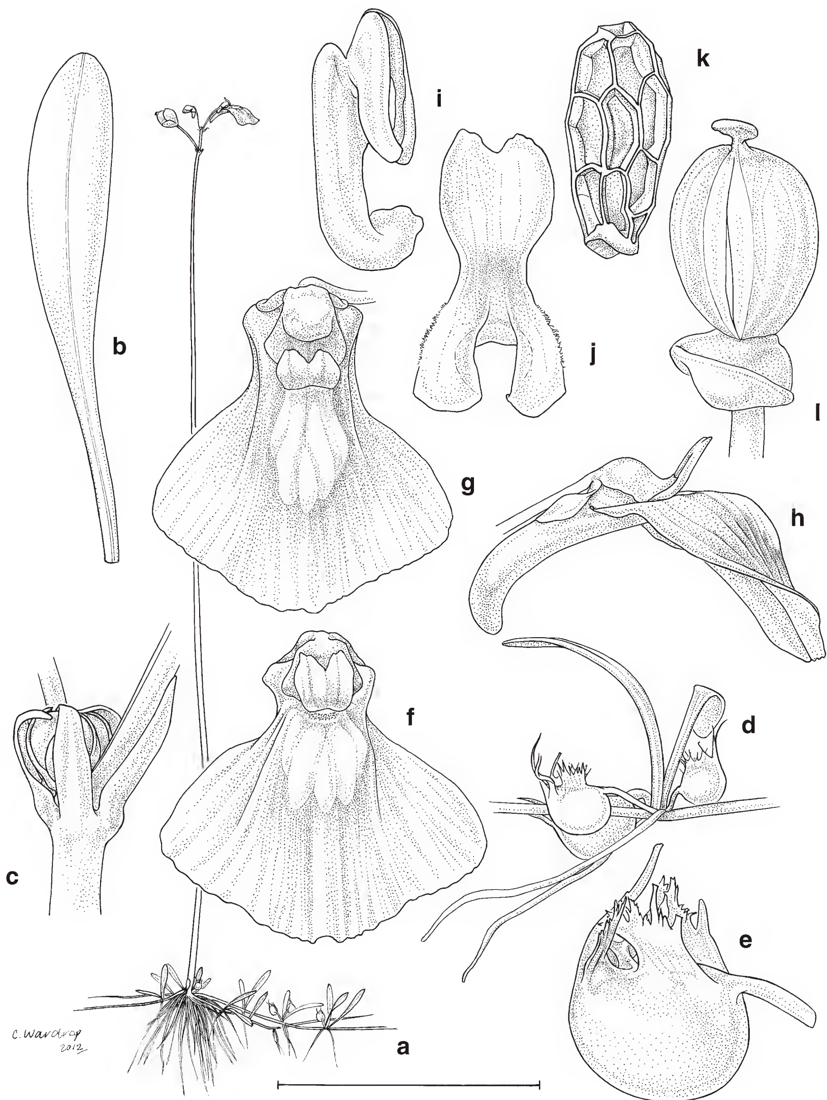
Fig. 1. Utricularia blackmanii a , habit; b , leaf; c , bracts & bracteoles with pedicel base in situ ; d , stolon node; e , bladder-trap in lateral view; f , flower in frontal view; g , flower in dorsal view; h , flower in lateral view; i , stamen; j , upper lip of corolla; k , seed; l , fruiting capsule with calyx. Scale bars: a = 60 mm; b , j , l = 5 mm; c = 3 mm; d , k = 6 mm; e = 2.4 mm; f – h = 10 mm; i = 2 mm. Material used: a , k = Jobson 1253 (NSW877562); f – h = photograph of living collection, Jobson 1253 ; b – e , i – j = Jobson 1253 (alcohol preserved material – NSW921352); l = Fensham 4638 (BRI–AQ499114).